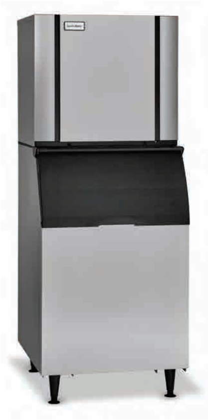
CIMO835G ON B55